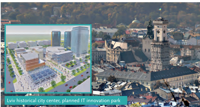
Lviv historical city center, planned IT innovation park

Final discussion conducted as a World Café